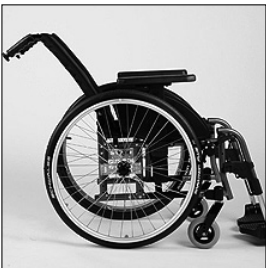
MD 10 Back support angle adjustment