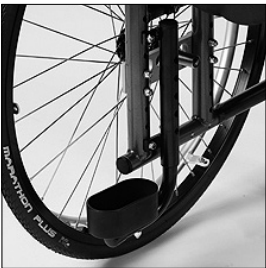
MA 58 Crutch holder, left