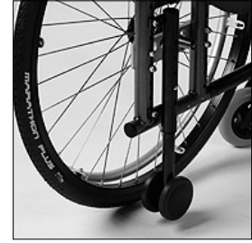
MA 50 Transport wheels adapter