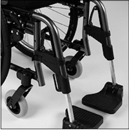
Front frame with leg support holders and standard foot plates