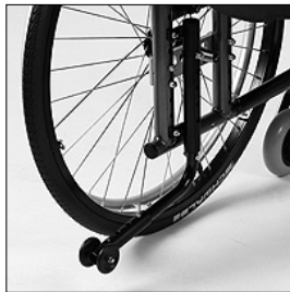
MA 56 Anti-tipper, left