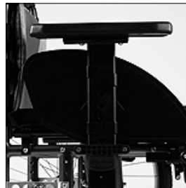
ME 11 Plug-on side panel