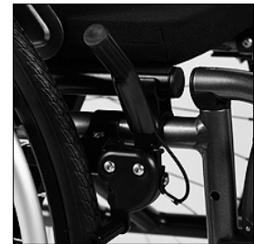
MH 10 Wheel lock lever extension