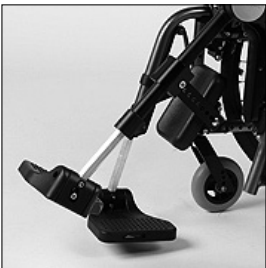
MB 27 Elevating leg supports