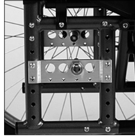
Rear frame with drive wheel adapter