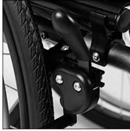
Knee lever wheel lock, standard