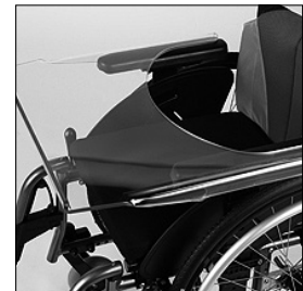
ME 60 Tray