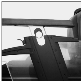
ME 05 Side panel with arm support